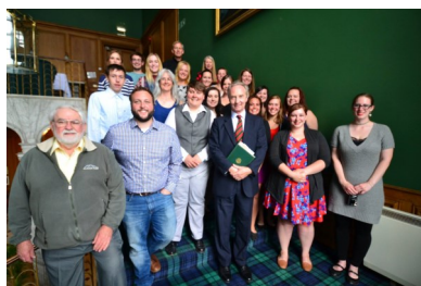
Students, faculty, and staff meet the Duke of Buccleuch (center) on the tartan stairs

Students in the summer 2015 Experience Scotland program had the unique experience of being in