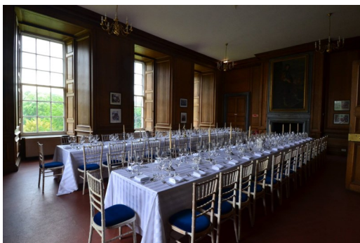
The dining room may have looked a bit different from traditional mealtimes at Dalkeith House, but the evening meal for the Royal Company of Archers still happened beneath the group photos of WIS participants.

(aside from Duke Richard's own wedding) hosted by a Duke in Dalkeith House in over 100 years. While the Dining Room received a makeover worthy of the Duke's esteemed guests, students were able to meet the Duke, and were treated to a dinner from the Cavaliere. Surely, this will be an experience students will not soon forget!